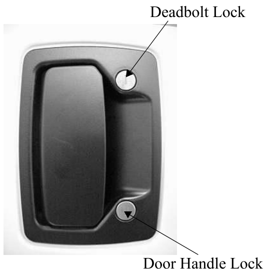
Entrance Door Handle - Outside

The entrance door may be opened from outside the vehicle by pulling the door handle outward. To open the door from inside, pull outward on the door handle. When the door is locked, neither the inside nor the outside door handle can be operated. It can be locked and unlocked from the outside of the vehicle by inserting the key into the lock and turning.