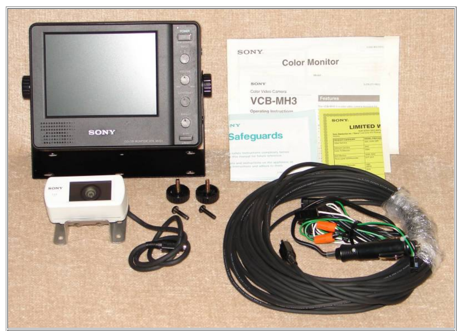
Click for Extra Large view of image above