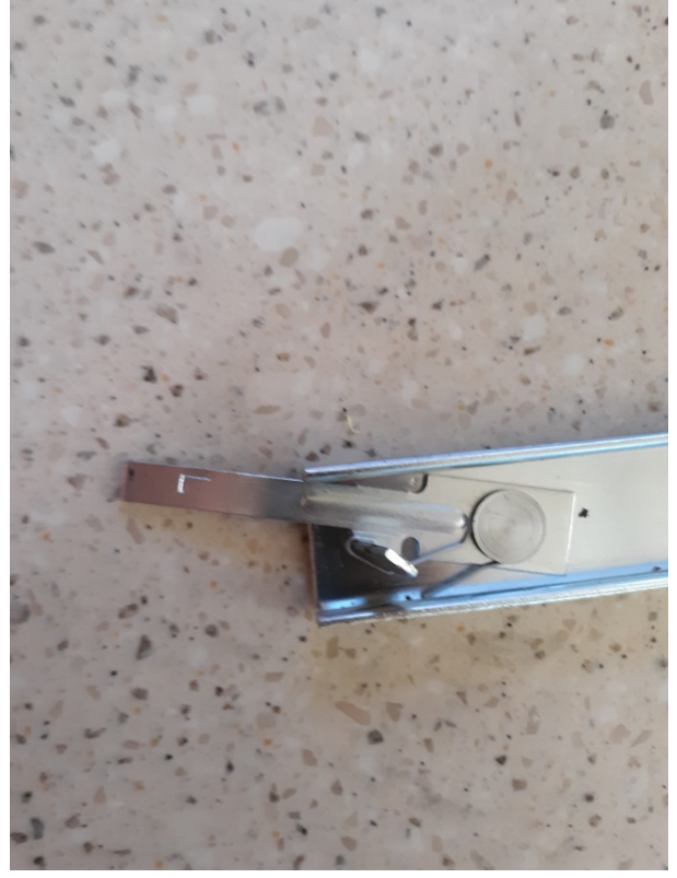
I opted to replace my center Winnebago slider with a new one; and then I added a new 20" PTO slider on top and one on the bottom. So now my pantry is very stable and has 3 slides! (Something Winnebago should have done from the beginning!

The latch is spring loaded and has a locking tab. In the picture this tab is square, but it can get warn down or even breakoff.