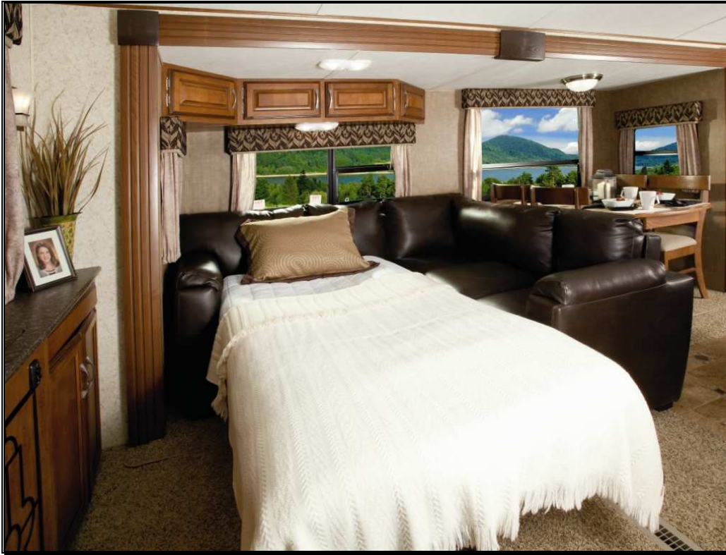
Sectional sofa with the bed made